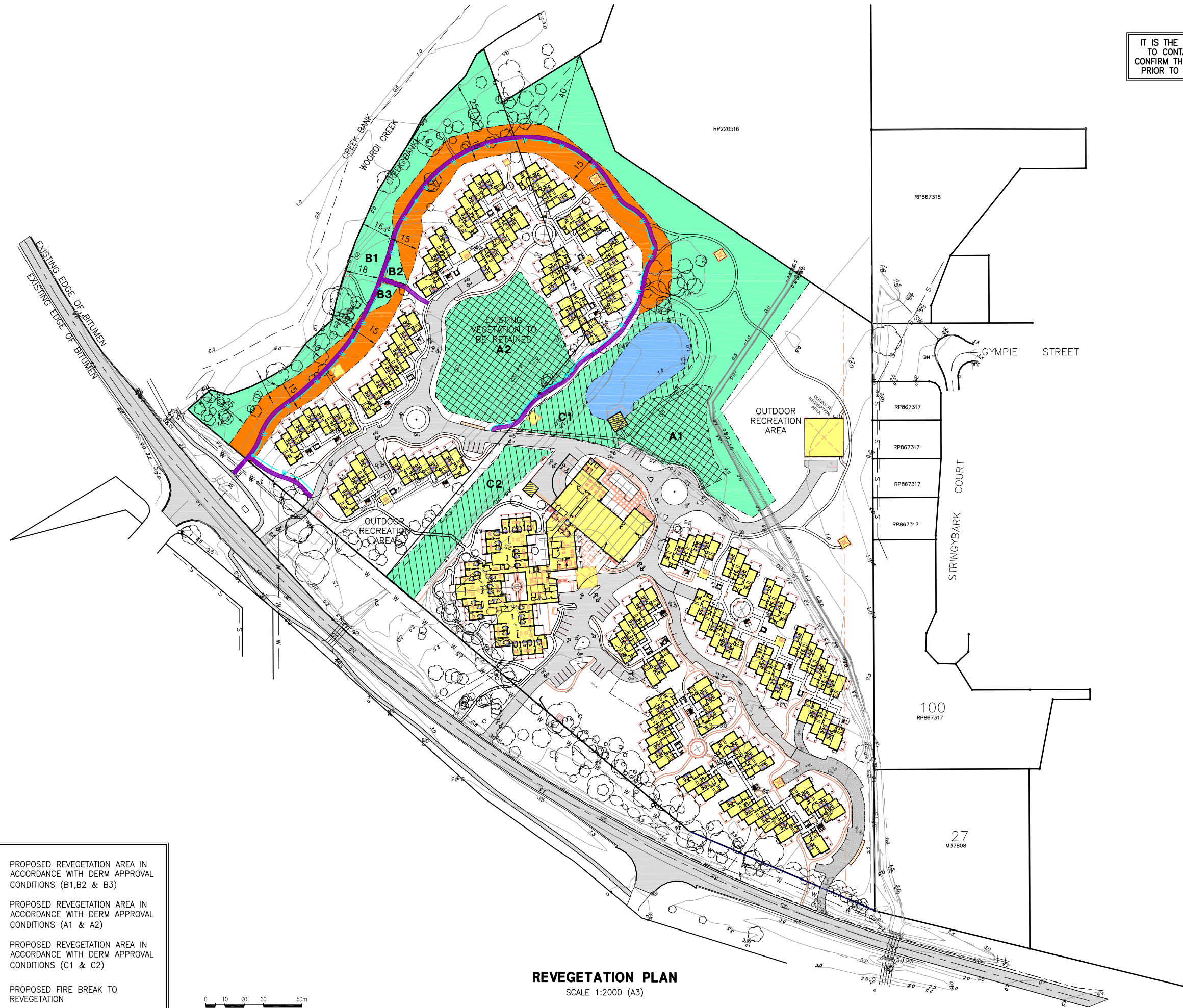
REVEGETATION PLAN SCALE 1:2000 (A3)

This Document is copyright and shall not be copied without written approval, nor shall it be used except for the Development and the Site Specified.