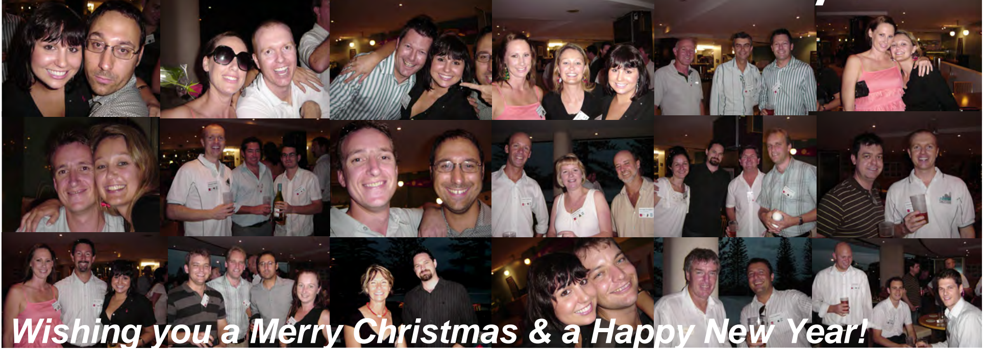
Wishing you a Merry Christmas & a Happy New Year!